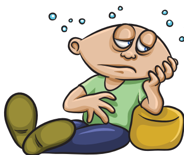
Weak or tired