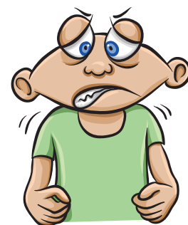
Nervous or upset

If low blood sugar is not treated, it can become severe and cause you to pass out. If low blood sugar is a problem for you, talk to your doctor or diabetes care team.