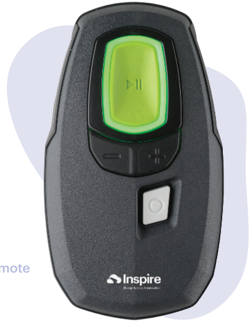
Inspire Sleep Remote

Inspire works inside your body while you sleep. It's a small device placed during a same-day, outpatient procedure. When you're ready for bed, simply click the remote to turn Inspire on. While you sleep, Inspire opens your airway, allowing you to breathe normally and sleep peacefully.